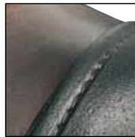
RTC with countersunk seams