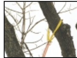
Friction saver shown installed in tree.